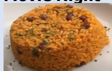
Arroz con habichuelas (Rice & Beans)