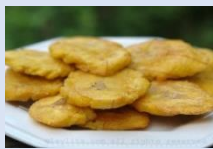
Tostones (Fried Plantains)