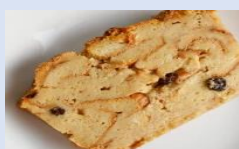
Budin (Bread Pudding)